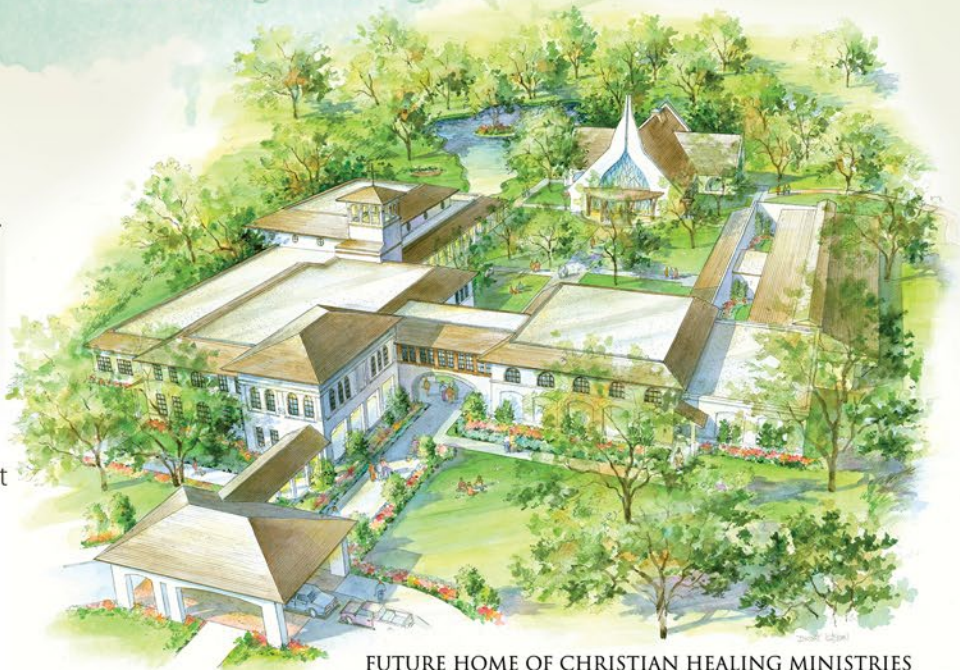
FUTURE HOME OF CHRISTIAN HEALING MINISTRIES

We pray that our dream becomes your own! Please consider partnering with us today by making a one-time donation, a monthly donation, or a planned gift.