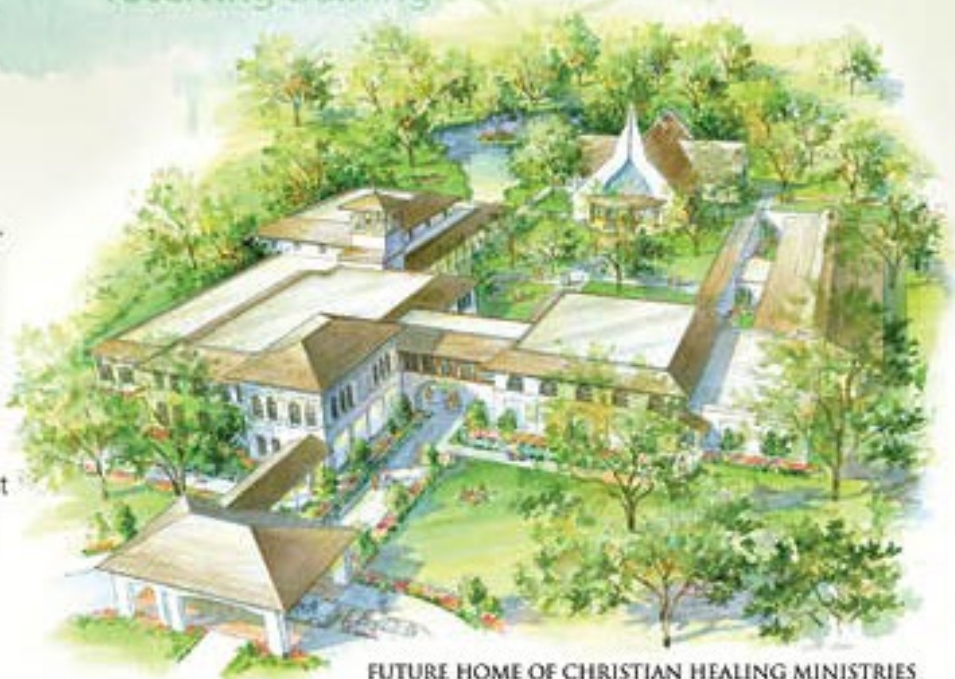
FUTURE HOME OF CHRISTIAN HEALING MINISTRIES

We pray that our dream becomes your own! Please consider partnering with us today by making a one-time donation, a monthly donation, or a planned gift.