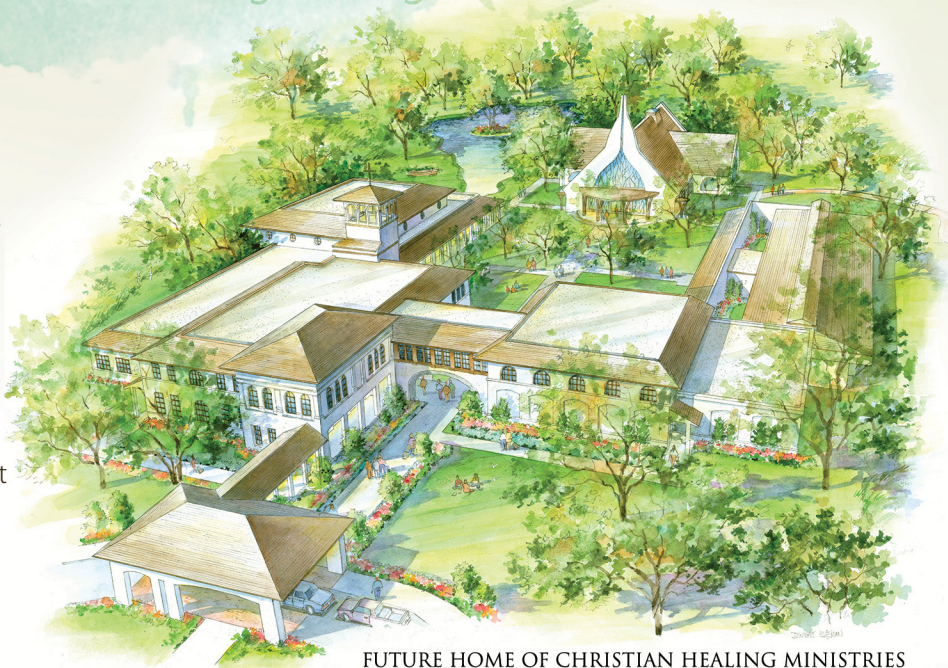
FUTURE HOME OF CHRISTIAN HEALING MINISTRIES

We pray that our dream becomes your own! Please consider partnering with us today by making a one-time donation, a monthly donation, or a planned gift.