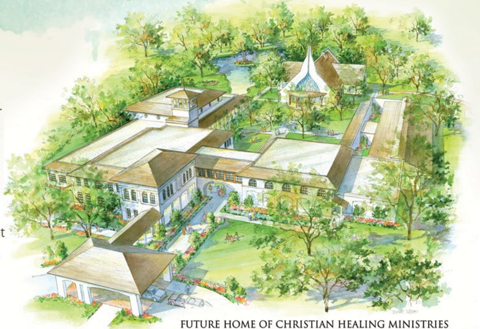
FUTURE HOME OF CHRISTIAN HEALING MINISTRIES

We pray that our dream becomes your own! Please consider partnering with us today by making a one-time donation, a monthly donation, or a planned gift.