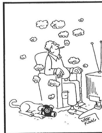
Jack Flynn ©MMI