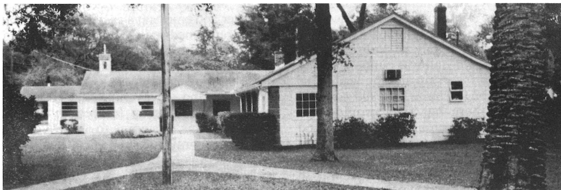
Fr. Frank Dearing Hall

Those of you who have been through Fr. Frank Dearing Hall at the Healing Center are aware it needs extensive renovating. The costs for the renovations are an estimated $35,000.00. Dearing Hall is presently used to hold seminars, healing services and by the intercessors. It will be used even more extensively after undergoing renovation. The sooner we have this work done, the better CHM will be able to serve Jesus in spreading His healing message.